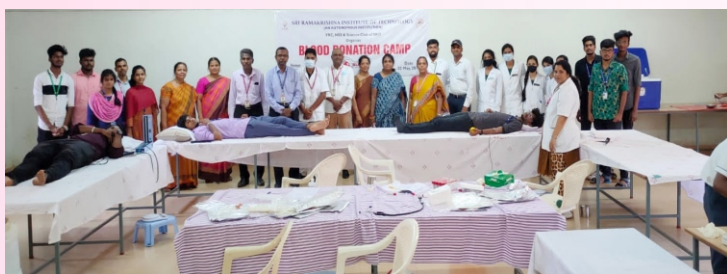
A Blood Donation Camp was organized on 5 th May 2022 at the college premises.