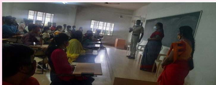
A seminar titled “Awareness on Anti Ragging” was organized on 4 th October 2021.